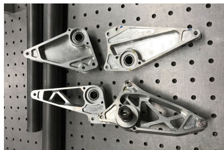
Redesigned bell crank compared to old bell crank