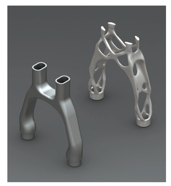
Comparison of Old and New Yoke

Mikhail Zhmaylo, a lead engineer at CompMechLab was tasked with the design and optimization of the yoke. According to Mikhail, "The current yoke was manufactured using a very complicated, time-consuming, and wasteful process. The part was CNC milled out of a titanium block in two parts. This was done so some of the material could be milled out from the inside of the part to save weight.