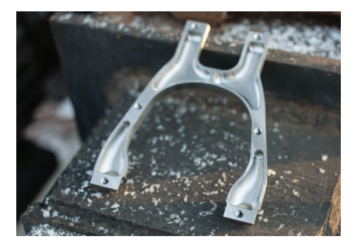
Original Design for Milled Yoke

The redesign of the part was extremely successful, Triton is currently working on finishing up the integration of the new design into their customized bike frame. In the future the team at Triton, with the help of CML AT and CompMechLab may also explore redesigning the frame's front yoke, as well as some of the frame's structural nodes.