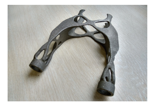
3D Printed Optimized Yoke